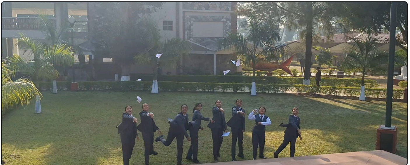
Moment Of The Month - “Giving Flight to Our Dreams”